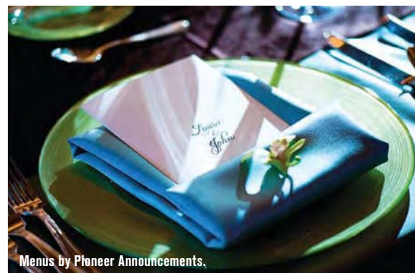
Menus by Pioneer Announcements.