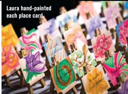
Laura hand-painted each place card.