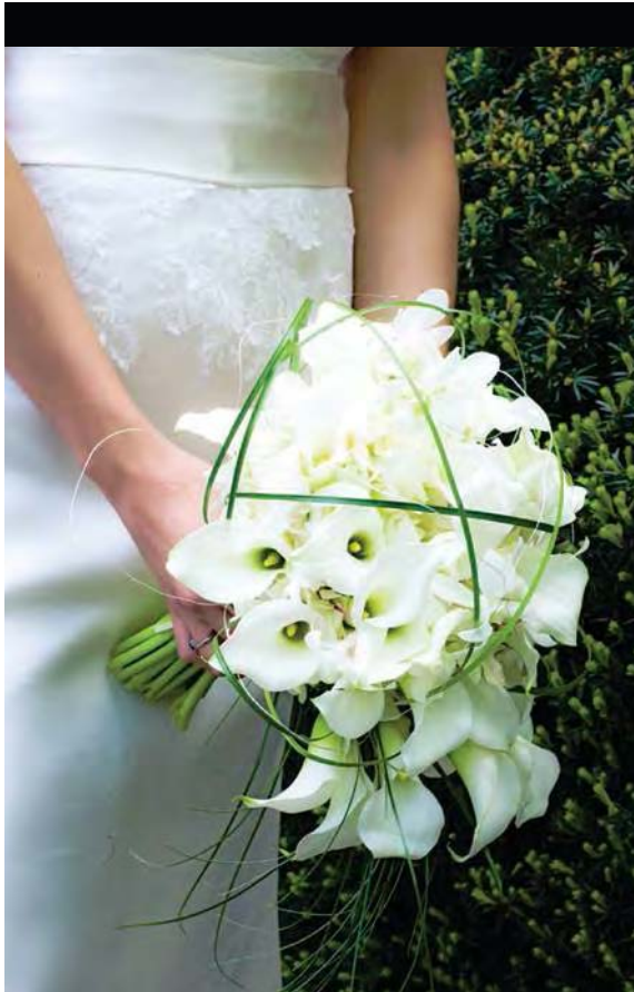
The calla lily and orchid, hand-tied bouquet by Flowers with Feeling looked like an organic work of art.